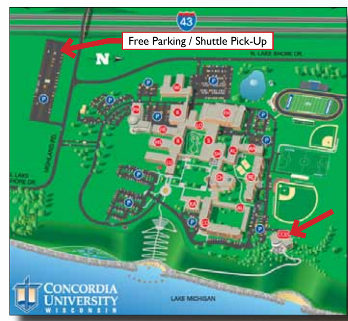
Map courtesy of Concordia University

For vendor and exhibitor table reservations, please call 414.352.2437